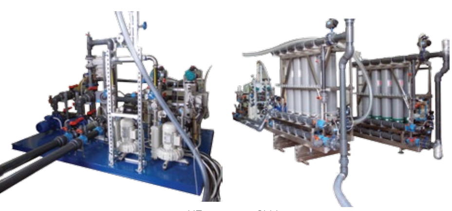
UF treatment Skids

The produced treated water from a DEVISE UF-PACK<sup>™</sup> system is the safest way to produce drinking water as the effluent water is always free of suspended solids, bacteria and other common contaminants found in raw water sources.